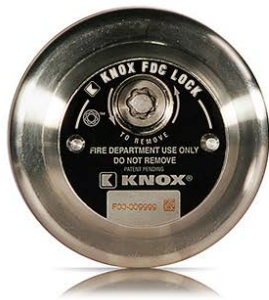
Model #3111 Retail: $249

Protect small fire department connections