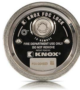
Model #3110 Retail: $199

Protect small fire department connections